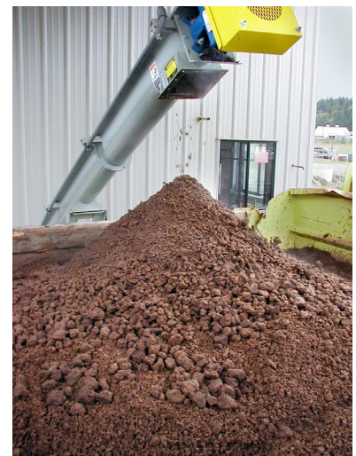
Dewatered and Pasteurized Biosolids from Sequim, WA FKC Class A Installation