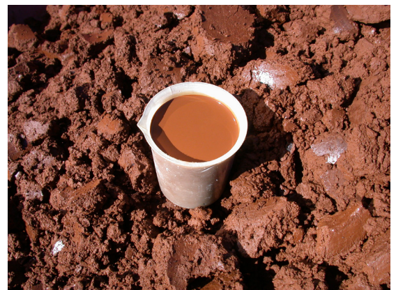
Inlet and outlet at Begonia Iron Removal Facility, Monterey, CA